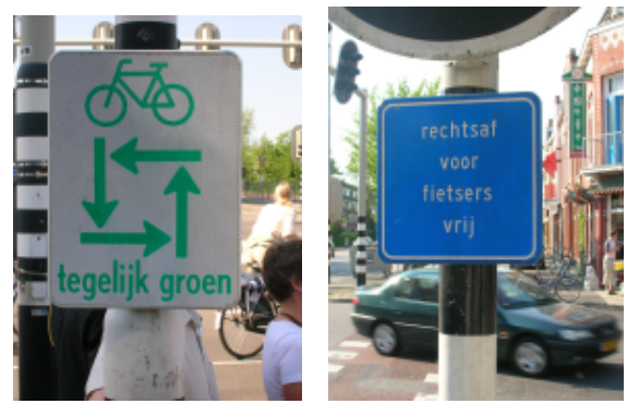
Green light for cyclists in all directions and right turn always allowed for cyclists