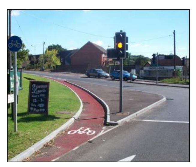
A cycling bypass past red – UK example (left-turn)